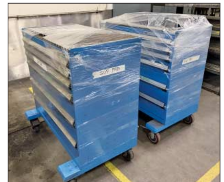
(2) Rosseau Cabinets with Wilson Dies