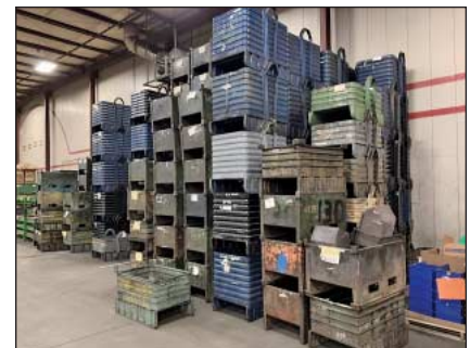
(100) Corrugated Steel Tubs