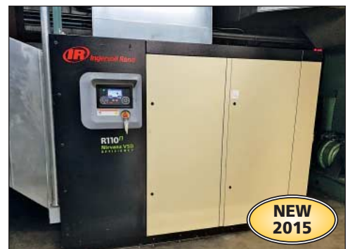
150 HP IR Model R110N-A Variable Speed Drive Air Compressor