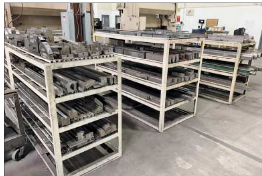
Very Large Quantity of Various Sizes & Styles Press Brake Dies