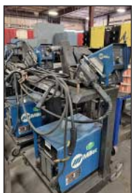
(7) 300 Amp Miller Axxess 300 Welders