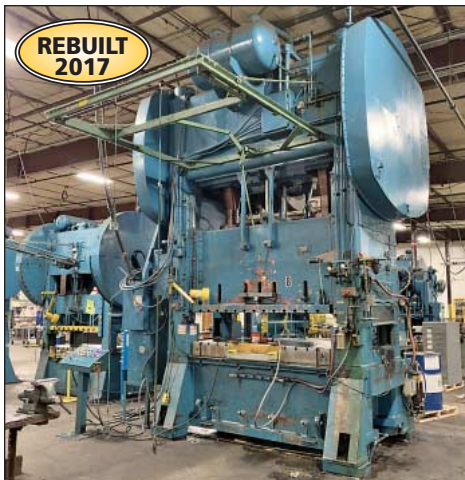
400 Ton Bliss S2-400-84-48 Straight Side Double Crank Press