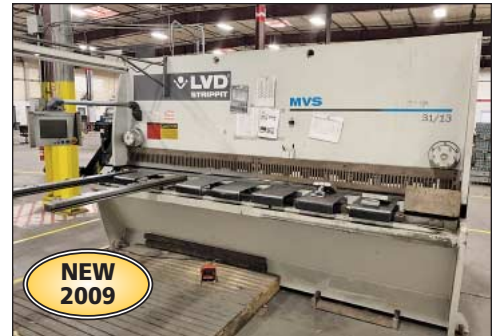
1/2" x 10' LVD Model MVS-TS 13/1300 Hydraulic Shear