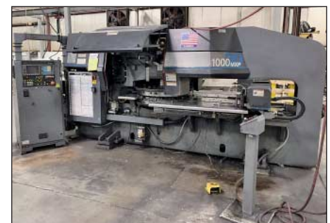
33 Ton Strippit Model 1000M XP/30 CNC Turret Punch