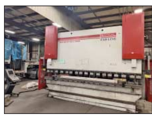
(9) Press Brakes

WEDNESDAY, MARCH 18TH STARTING AT 10:00 AM INSPECTION: Tuesday, March 17th from 9:00 AM to 4:00 PM