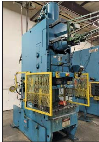
110 Ton Niagara E-110 OBI Press