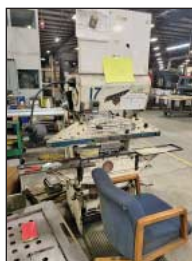
(2) 14 Ton x 4' Di-Acro Model 16-48 Press Brakes