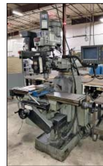
3 HP Sharp Model TMV 2-Axis CNC Vertical Mill with Acu-Rite Control