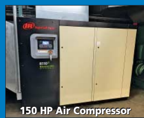
150 HP Air Compressor