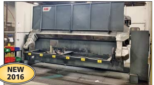
Wolf Robotics Two-Station Robotic Welding Cell w/ ABB Robot & Lincoln R500 Welder