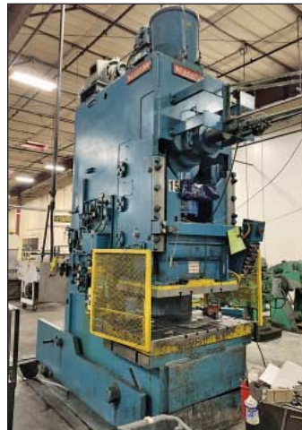
250 Ton Niagara E-250 OBI Press