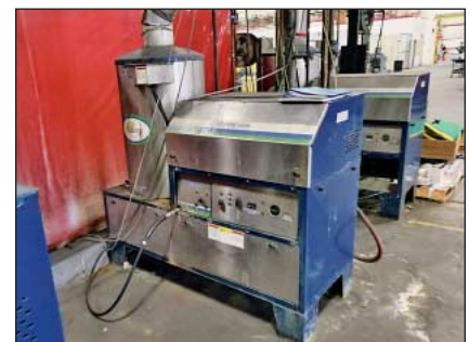
(4) Galaxy System 1024 Steam Cleaners