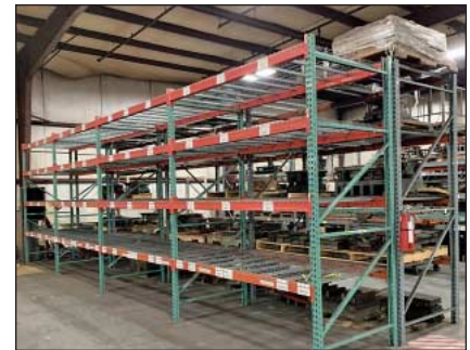
(20) 48" x 8' x 10' H Sections Pallet Rack with Decking