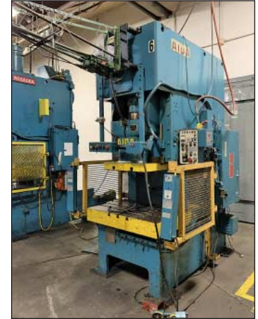
165 Ton Aida NC1-15(2) Gap Frame Press