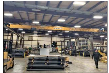
3 Ton x 60' Approx. Span x 150' Long EMH Single Girder Free-Standing Bridge Crane