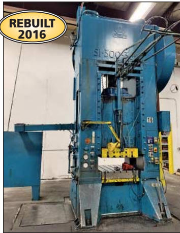
300 Ton Williams & White S1-300-36-42 Straight Side Single Crank Press

SALE DATE: WEDNESDAY, MARCH 18TH, STARTING AT 10:00 AM