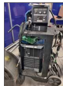
350 Amp Miller Continuum 350 Welder