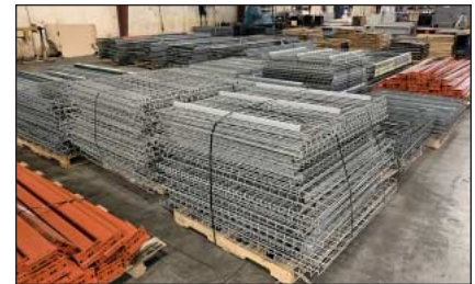
Large Quantity of Disassembled Pallet Rack Including Uprights, Beams, & Wire Decking