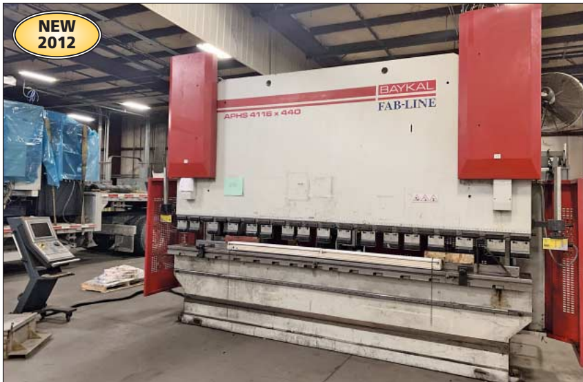
440 Ton x 13'6" Baykal APHS 4116 x 400 CNC Press Brake

INSPECTION: TUESDAY, MARCH 17TH FROM 9:00 AM TO 4:00 PM