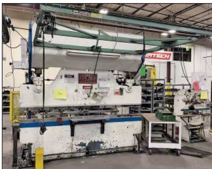
150 Ton x 10' Chicago 810-R Mechanical Press Brake