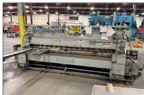
10 Ga. X 10' Wysong Model 1010-HD Shear