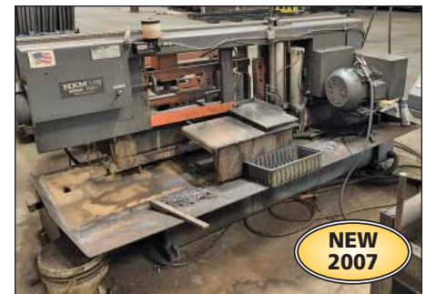
16" x 22" HEM Cyclone Auto-C Mitre Base Automatic Horizontal Band Saw