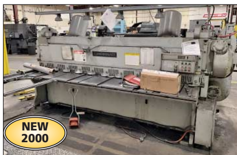
1/4" x 10' Cincinnati 1810G Mechanical Shear