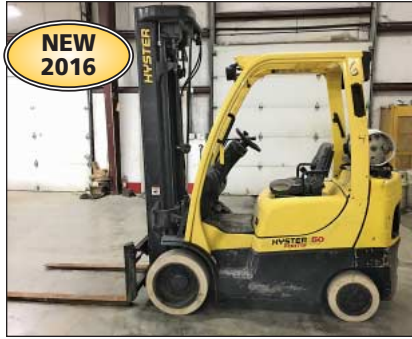
(4) 5,000 Lb. Hyster Model: S50FT LP Gas Solid Tire Lift Trucks