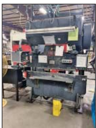
60 Ton x 6' Chicago 46-L Press Brake with Hurco Back Gage