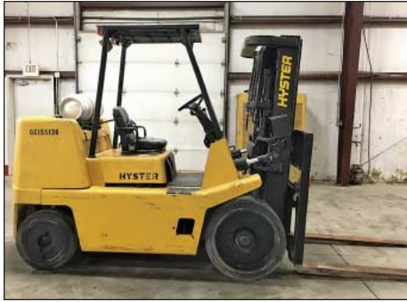
(2) 15,500 Lb. Hyster Model S155XL2 LP Gas Solid Tire Lift Trucks

SALE DATE: WEDNESDAY, MARCH 18TH, STARTING AT 10:00 AM