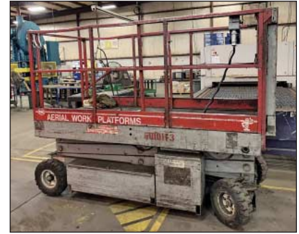
MRC Electric Self Traveling Scissor Lift