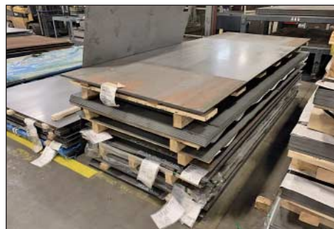
Large Quantity of Various Steel Sheet Metal Inventory