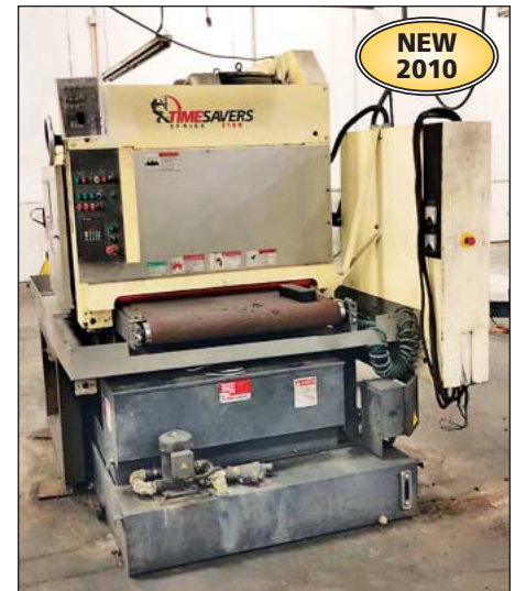
36" Timesaver Model 3121-13-04 Pass Thru Wet Belt Sander

2500 Littell Uncoiler with 20" Rowe Straightener, 12" to 24" Minimum/Maximum Width