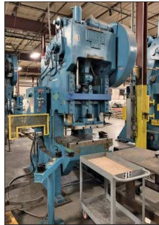
75 Ton Bliss C-75 OBI Press