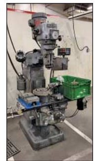
1.5 HP Bridgeport Vertical Mill w/DRO